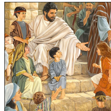
"Let the Children Come"

The target for completing the onsite preparations is around October. There will be opportunities for our members to help with various tasks once the work begins, to keep our costs at a minimum. Look for these opportunities and volunteer if you have skills in a certain area!